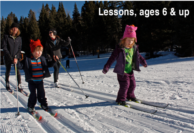
Lessons, ages 6 & up