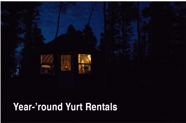
Year-'round Yurt Rentals