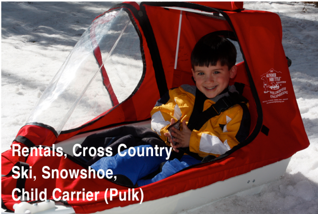
Rentals, Cross Country Ski, Snowshoe, Child Carrier (Pulk)